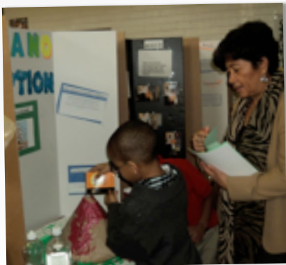
AMOS 1 SCIENCE FAIR