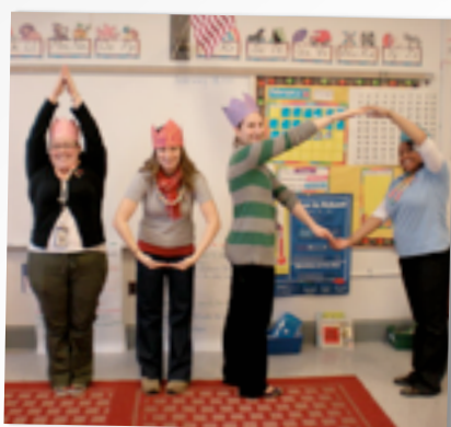
100TH DAY OF SCHOOL